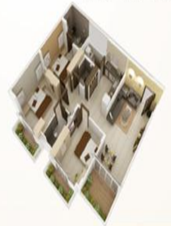
Typical 3 BHK Plan